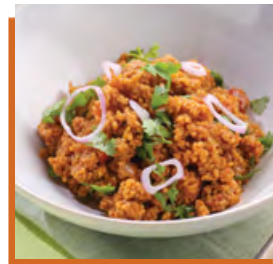
Millet Biryani (page 79) (411 kcal)