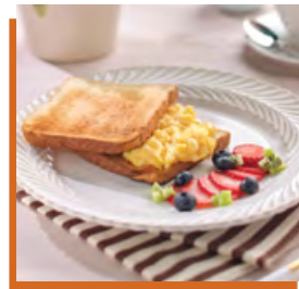
Mixed Fruit Toast with Scrambled Egg (page 23) (350 kcal)