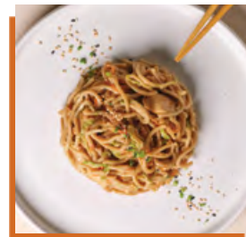
Wholegrain Chicken Chow Mein (page 15) (390 kcal)