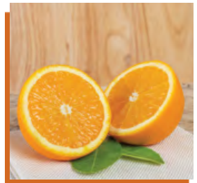
Fresh Fruit (60-80 kcal)