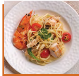
Fusion Seafood Pasta (page 57) (455 kcal)