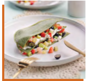
Matcha Crepe with Mixed Fruit (page 129) (135 kcal)