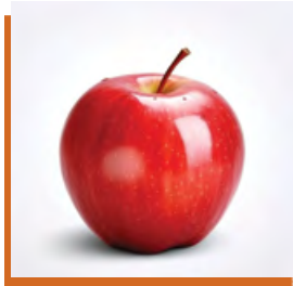
Fresh Fruit (60-80 kcal)