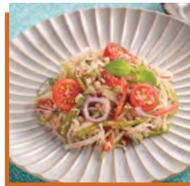
Tuna Garden Salad (page 145) (121 kcal)