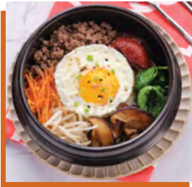
Korean Bibimbap (page 59) (485 kcal)