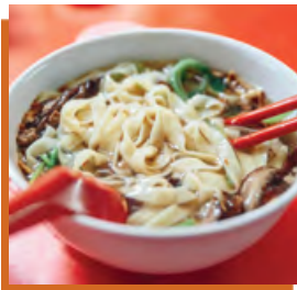
Ban Mian Soup (eating out; ask for less noodles) (475 kcal)