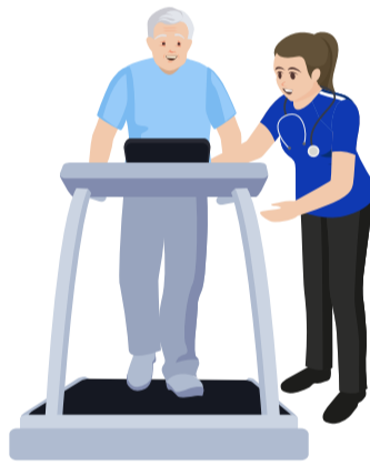
Persons doing exercises