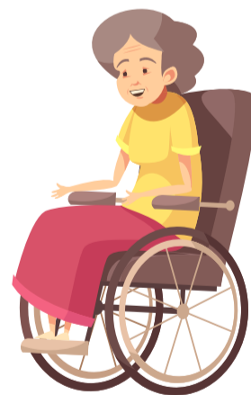
Persons in wheelchairs