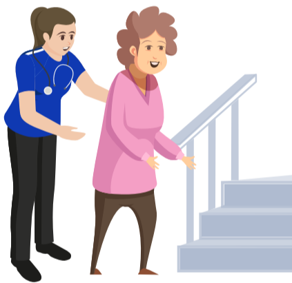
Persons using stairs