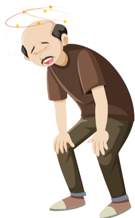
Persons experiencing giddiness