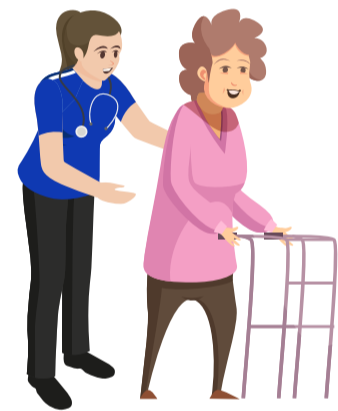
Persons using walking aids