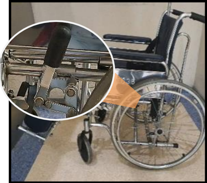
Lock wheelchair when stationary and during transfer