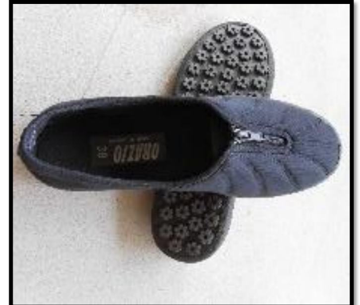
Wear appropriate footwear with adequate friction