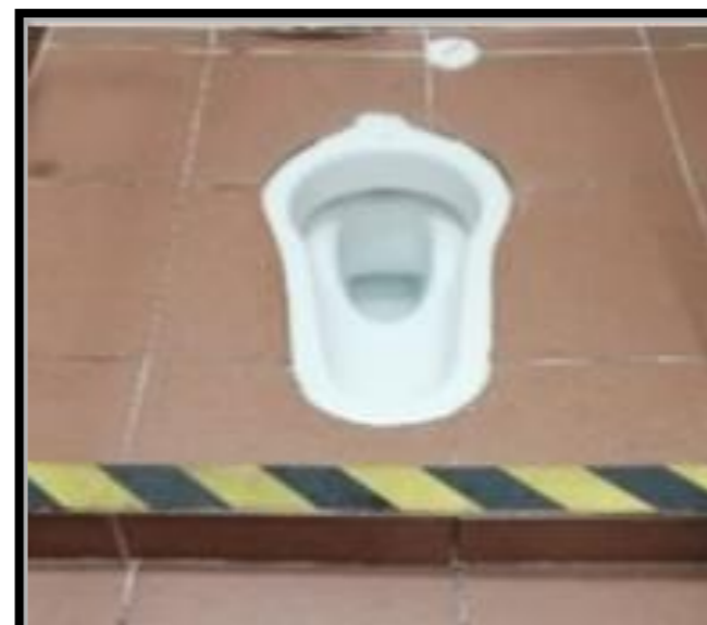
Avoid using squatting toilets if you have weak legs