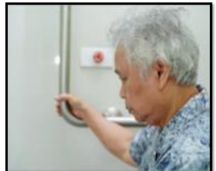
Support yourself with grab bars