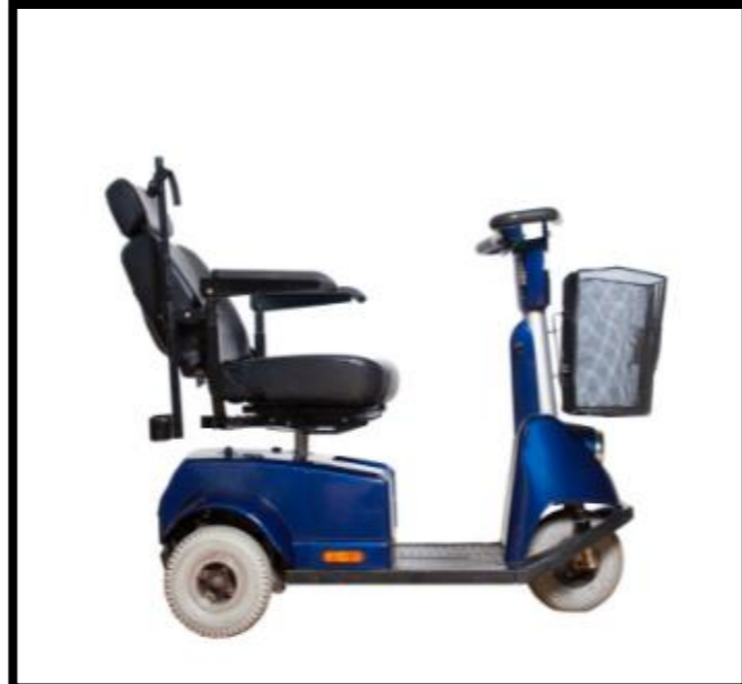
Keep mobility scooter within speed limit of 5 km/h