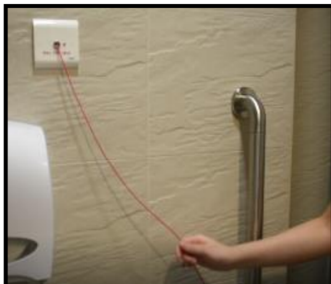
Pull the call bell for help