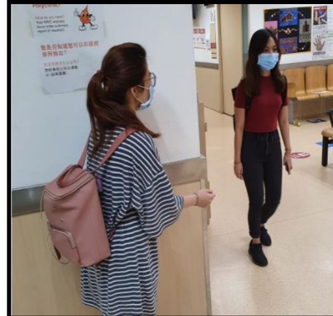
Do not rush, focus when walking