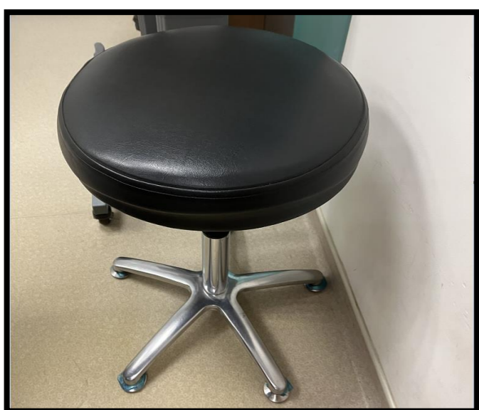
Do not sit on chairs with wheels or without back support